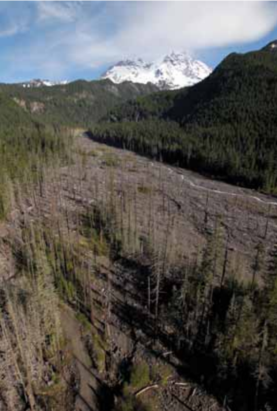
Figure 3. A surfeit of sediment due to debris flows and glacial outburst floods from the South Tahoma Glacier has led to a disequilibrium whereby Tahoma Creek has built itself up higher than surrounding land, catastrophically avulsing into an old-growth forest, which has destroyed riparian habitat and park infrastructure.