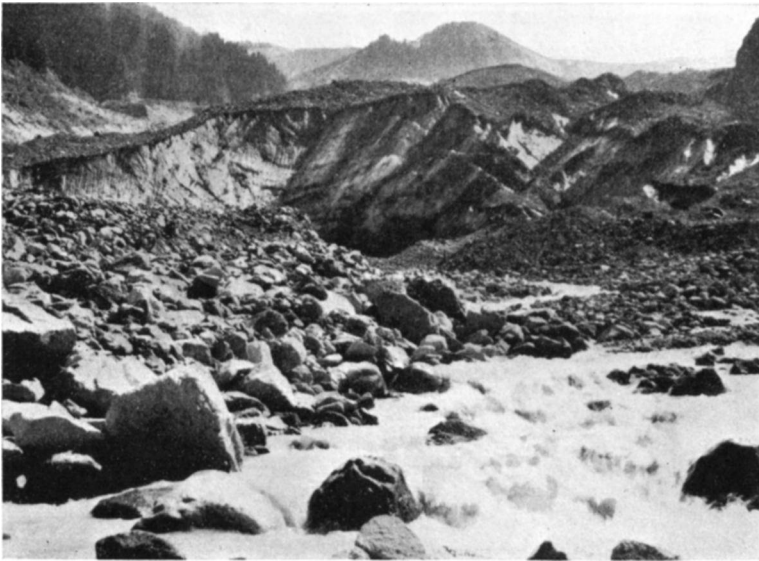
FIG. 4.—Terminus of the Carbon Glacier in 1937, as viewed from the marker from which recession is measured, 870 feet from the ice.

The initial attempt to establish a permanent point from which to compute annual recession data on this glacier was made on Sep-