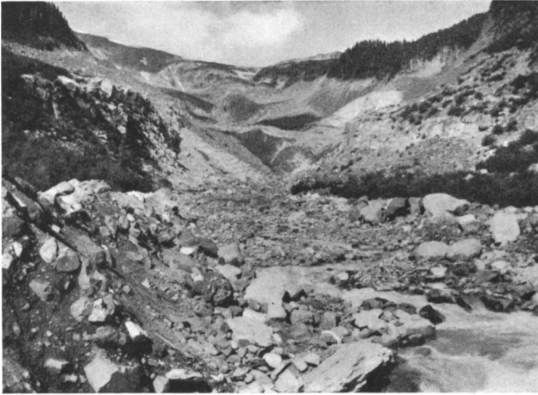
FIG. 2.—Terminus of the Nisqually Glacier in 1937, as viewed from the bridge which spans the Nisqually River; the approximate location of the terminus of the Nisqually Glacier in 1885.

Table 2 indicates that the rate of recession in the case of the Nisqually Glacier has been much greater since 1918 than was the