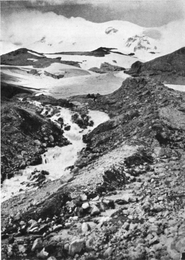
FIG. 7.—Terminus of the Stevens Glacier in 1937, as viewed from the point which marked the edge of the ice in 1935.