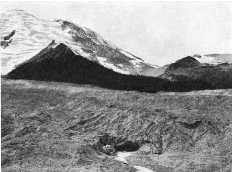
FIG. 3.—Terminus of the Emmons Glacier in 1937, as viewed from a point on the trail overlooking the ice.

river bed below the ice. 15 The terminus presented the appearance of a wide, irregular, concave curve with a broad lobe of moraine-covered ice extending downstream on each side of the White River, which emerged from the ice near the middle of this curve. It was thus apparent that it would be difficult to compute the recession with any degree of accuracy other than by means of measurements from a base line.