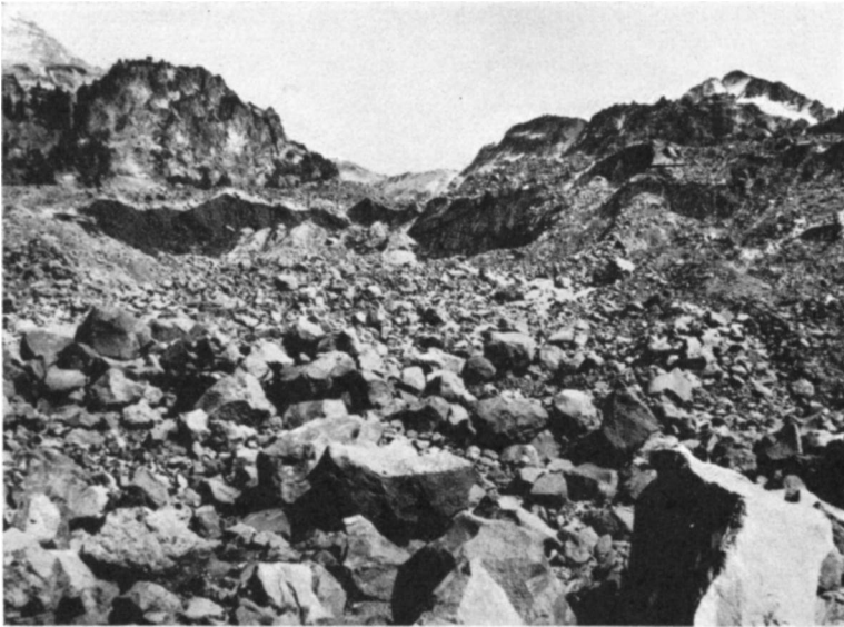
FIG. 5.—Terminus of the South Tahoma Glacier in 1937, as viewed from the “established photo point” on the river bar.

On September 7, 1934, in anticipation of a change in the course of the stream which would cause it to emerge from a different point in the ice, a second marker was established. This marker, known as point B , was 142 feet from the ice. By 1935 the anticipated change in the stream had occurred, and the point from which the stream